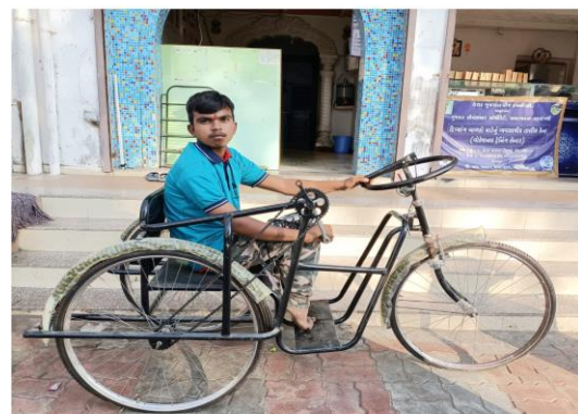
Shri Brahma Samaj Seva Trust Mahesana